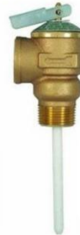
T&P Relief Valve 100 psi 210 F