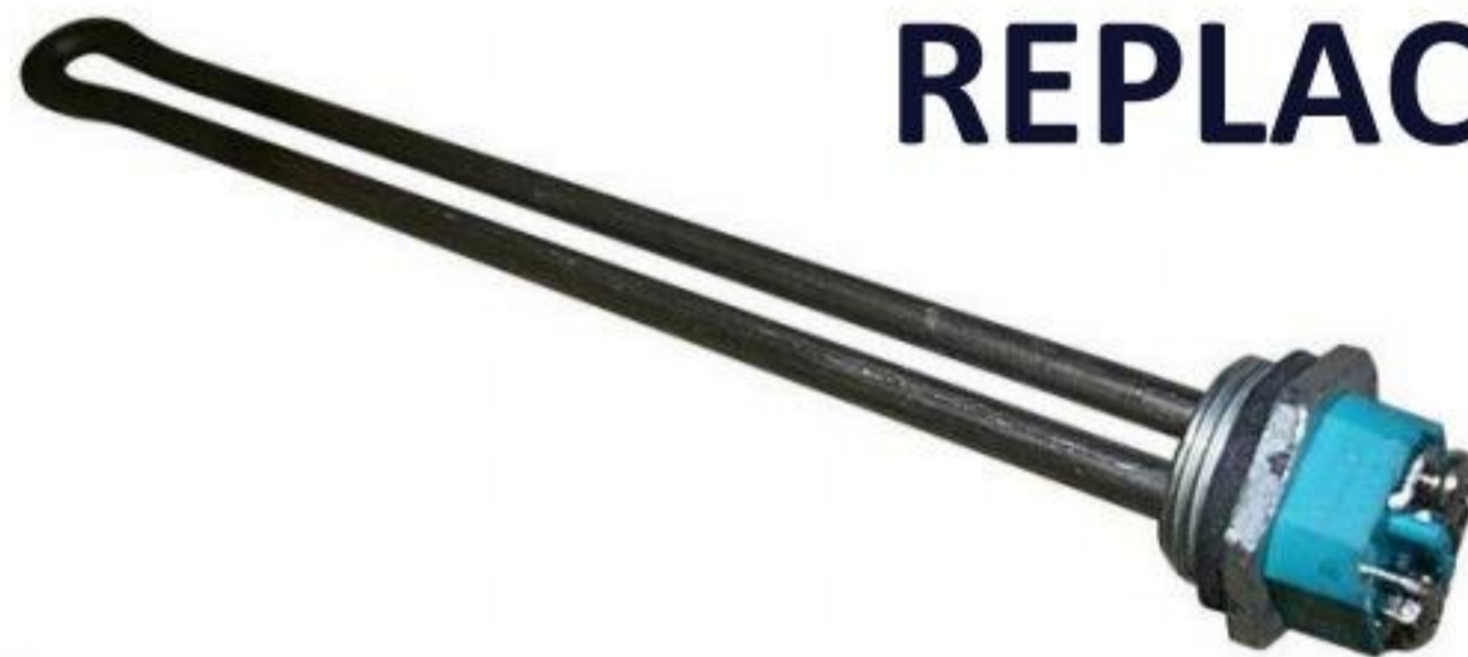
Incoloy Sheathed Stainless Steel Elements